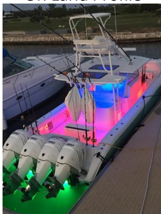
Deck and Underwater Lights