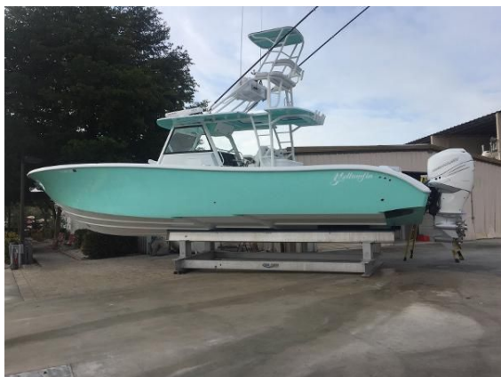
On Land Profile