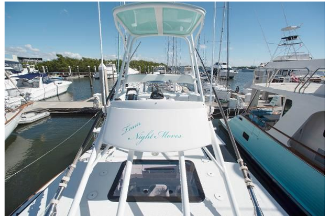
Upper Helm Roof